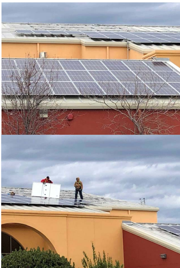
The Roof Of the Life Center

If your Ministry has an event coming up that is not listed, please contact the office.