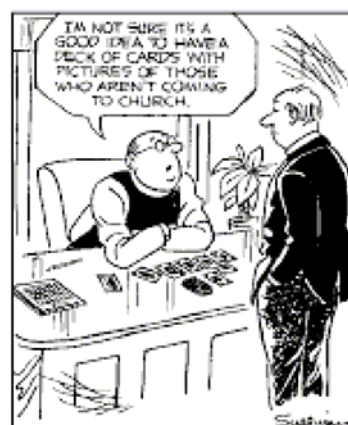
from The Joyful Nunsletter