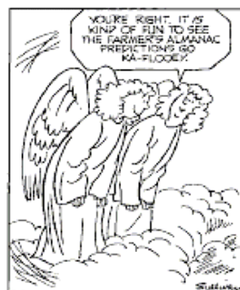
from The Joyful Newletter