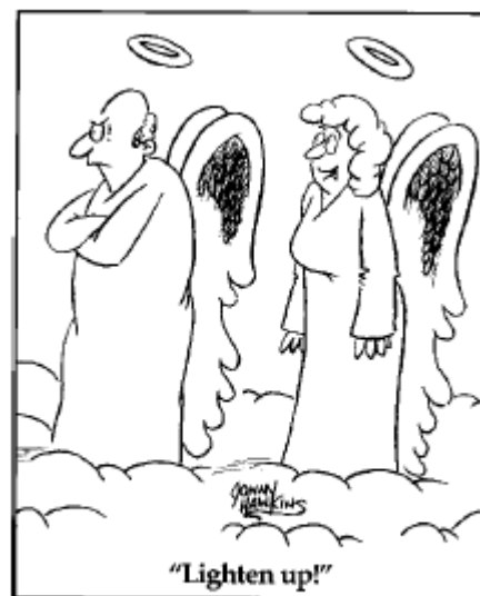
from The Joyful Noiseletter