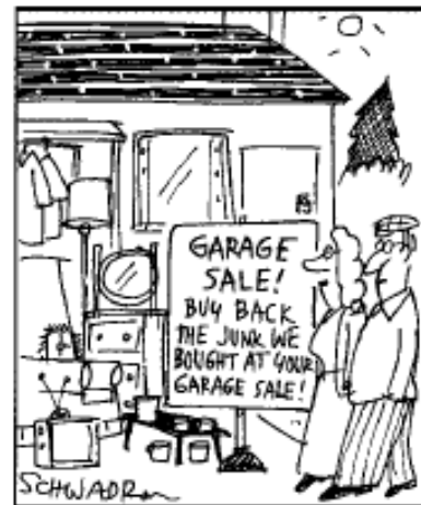
from The Joyful Noiseletter Reprinted with permission