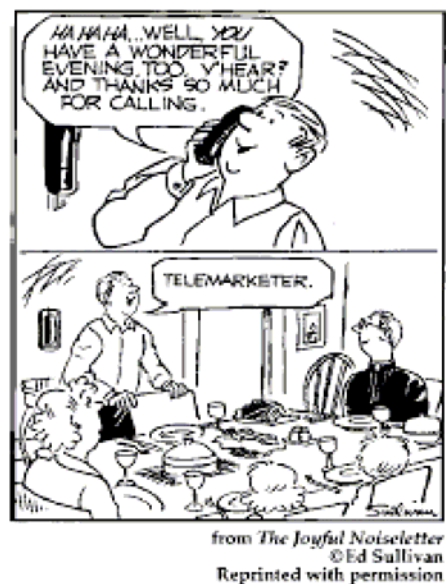
from The Joyful Noiseletter Reprinted with permission